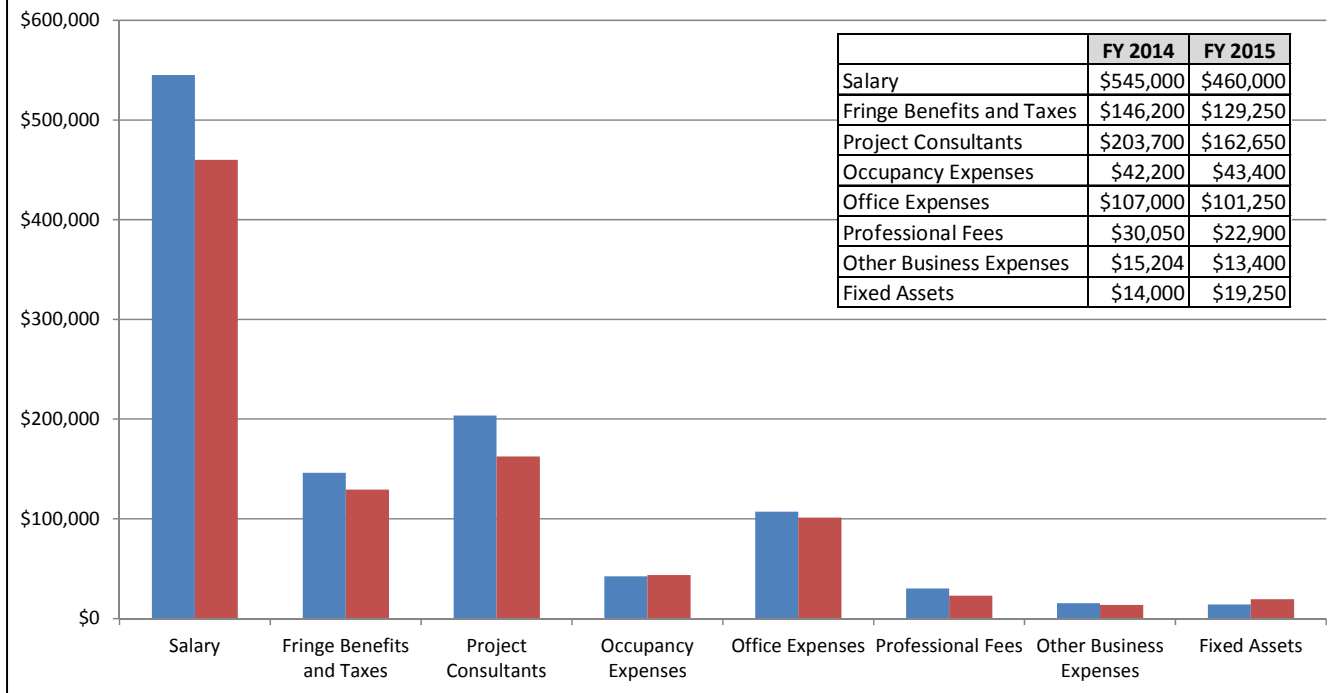
UVLSRPC FY 2014 and 2015 Budget Comparison (Expenses by Category)