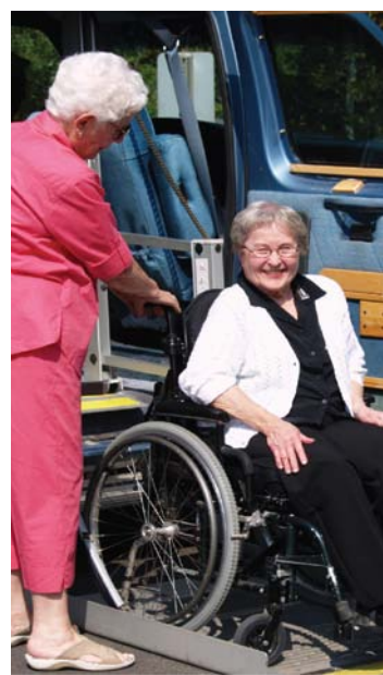
Volunteer Drivers at Red Cross and Community Alliance Transportation