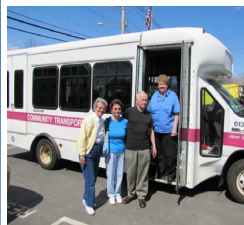
Community Alliance of Human Services to Newport Senior Center