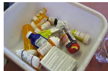
Sample of unwanted medicine