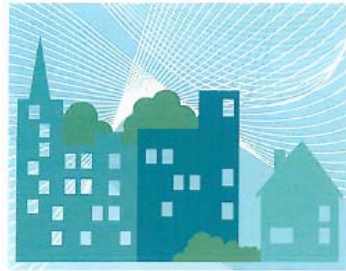
New Hampshire Broadband Mapping Program

UVLSRPC has been working with the University of New Hampshire and the state's regional planning commissions to map the availability of high-speed Internet or broadband access in New Hampshire. The New Hampshire map, along with those from 49 other states, 5 territories and the District of Columbia, are being processed into a nationwide interactive map that will be published online on February 17, 2011. This nationwide effort is funded through the State Broadband Data and Development Program (SBDD) of the National Telecommunications and Information Administration, with funds appropriated through the American Recovery and Reinvestment Act. The SBDD Program is designed as a comprehensive, nationwide approach "to facilitate the integration of broadband and information technology into state and local economies." The national map will be accessible through http://www2.ntia.doc.gov/ .