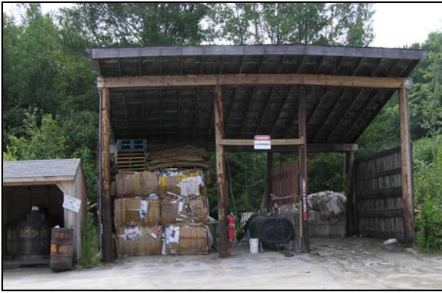
Bales of Recyclables at Grantham Transfer Station