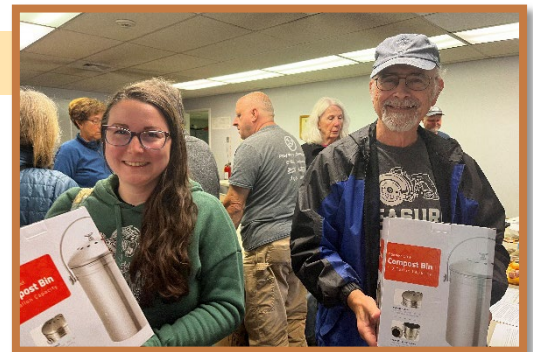
Photo. Enfield workshop attendees leave smiling with a kitchen counter scraps bin.